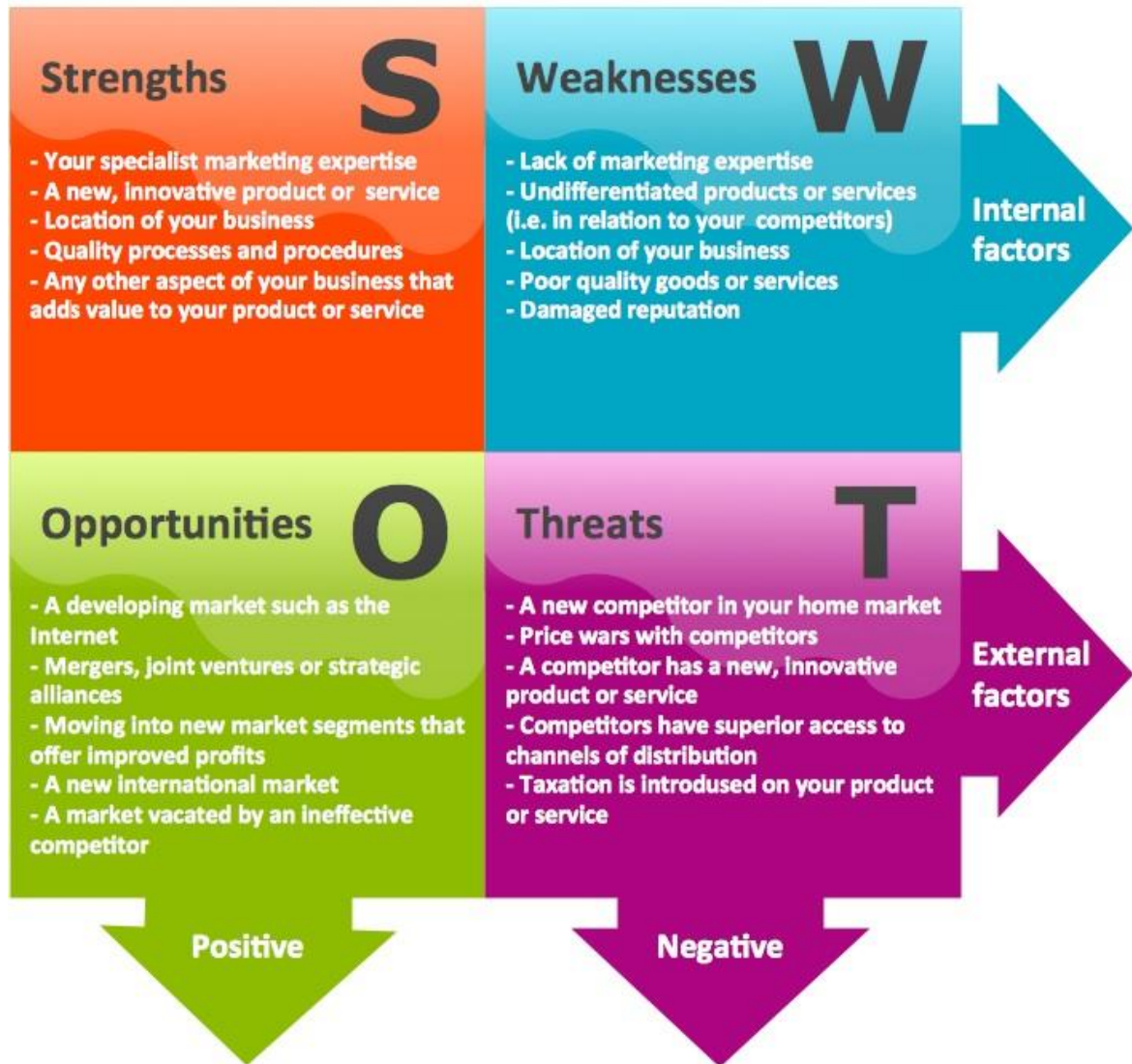
Figure 1. SWOT Analysis, accessed April 2, 2014, http://conceptdraw.com/ .