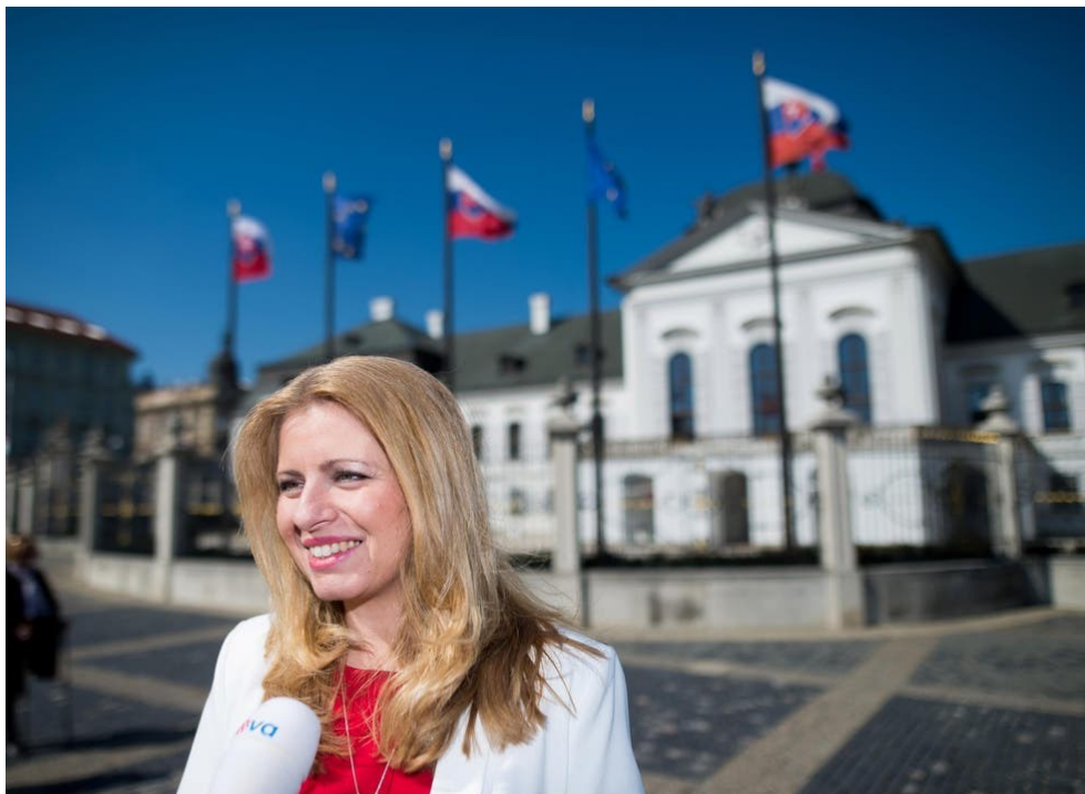
Figure 6 Picture 2B: Simicek, Vladimir. Zuzana Čaputová. 2019. Photograph. Getty Images/iStockphoto. In The Independent.

The pictures examined do not show the actual process of Čaputová becoming a president (e. g. the election night). Instead, they show her as a ready-made figure of Slovak politics who confidently owns her position. In both (2A and 2B) settings symbolise the office of the president. The device that could carry connotations would be the flag of Slovakia and the