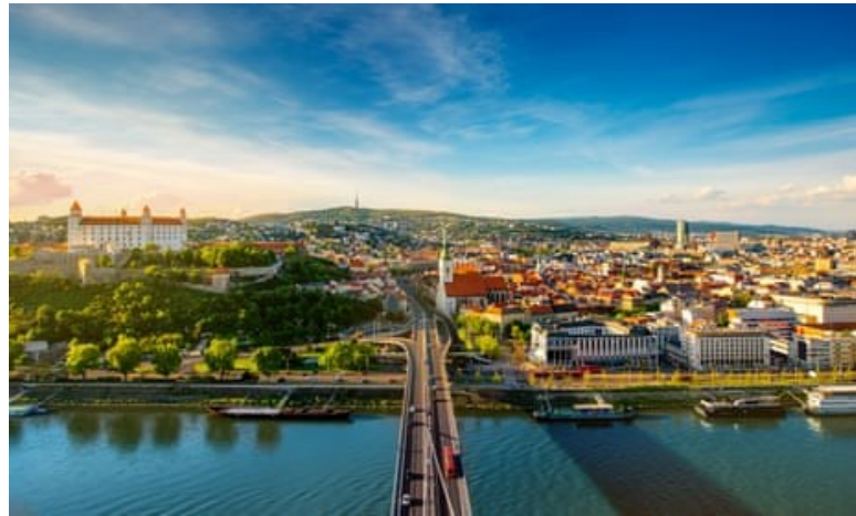
Figure 3 Picture 1A: RossHelen. Výhled na panorama Bratislavy na staré město. 2016. Photograph. Getty Images/iStockphoto.