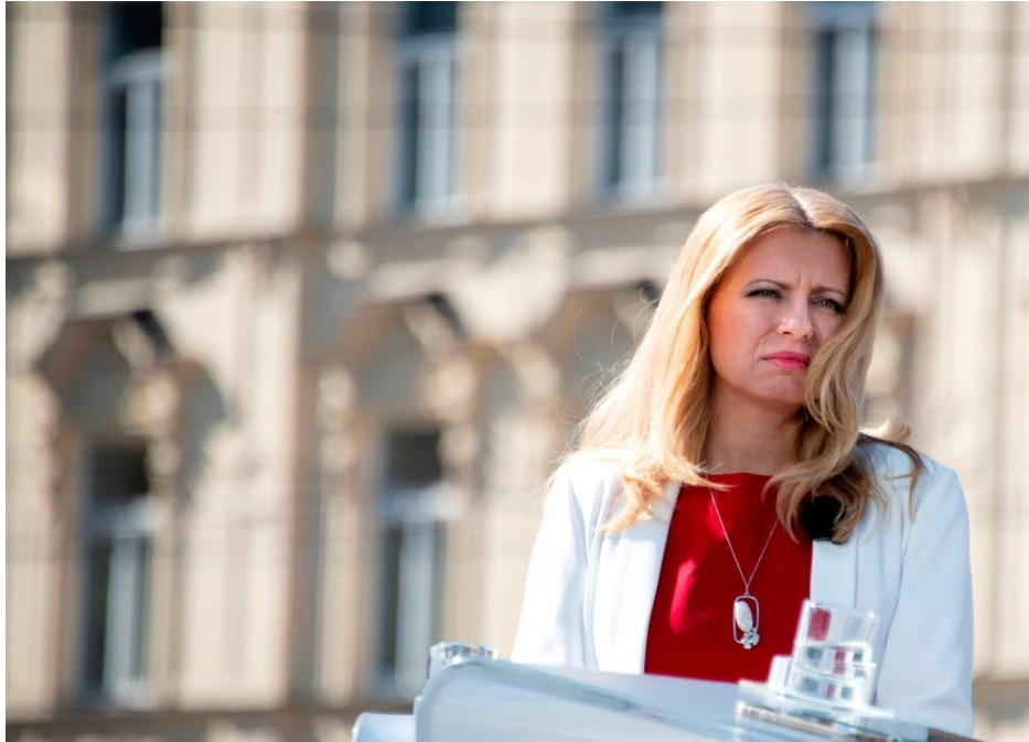
Figure 5 Picture 2A: Klamar, Joe. Zuzana Čaputová. 2019. Photograph. Getty Images. In The Independent.