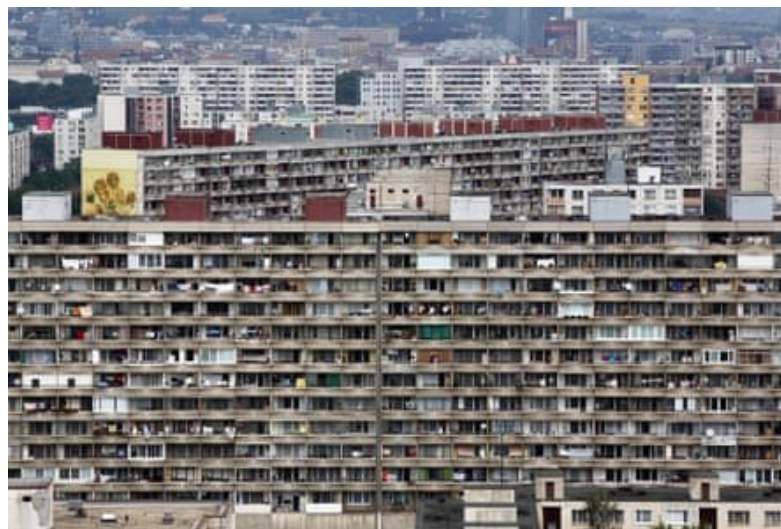
Figure 4 Picture 1B: Levene, David. The Petržalka Region in the South of Bratislava. 2018. Photograph. In The Guardian . (Reprinted with permission of David Levene)

Depicting old, decaying buildings with window-to-window flats next to one another, picture 1B connotes coldness, lack of progress and overall feeling of oppression. The thought-provoking question is why it was used in the article. The plausible explanation seems to be the text accompanying the picture, explaining that this is Petržalka (one of the parts of the capital city), and the blocks of flats reach far back to the communist history of the country. Nevertheless, this clearly serves to create associations in the reader's mind, as when the reader sees this picture, hardly ever will they think about visiting the country. In this picture, this part of Petržalka is presented solely as a soulless place. However, it is essential to note that this aspect could have been omitted should the article aim only to promote travel to Slovakia. Many people may be discouraged from visiting if such strong associations and